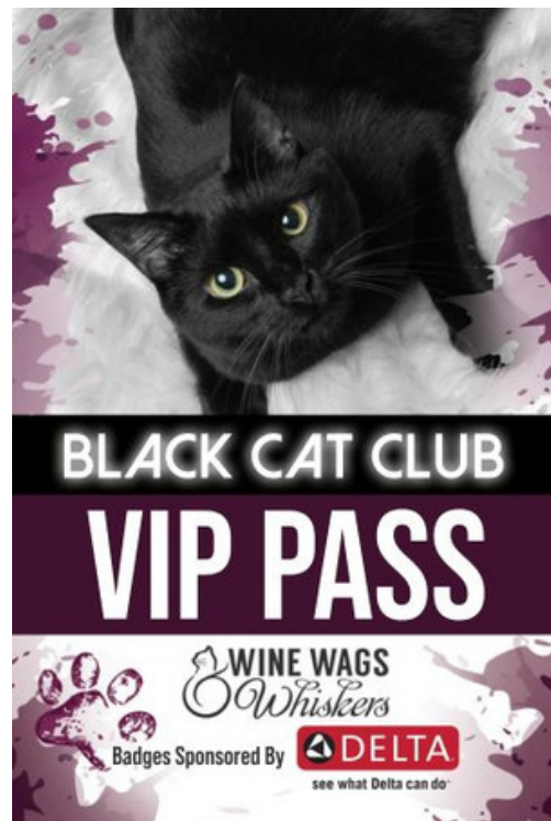
2025 VIP BADGE